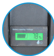
Battery level indicator