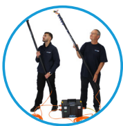
Option to upgrade to a twin operated system