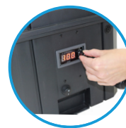
Fitted flow speed controller